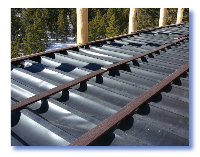
Our system captures and channels water away from your house.

Easy installation for both professionals and home owners.